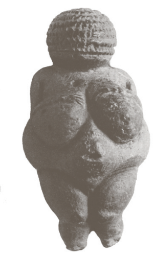
The Stonemasons crafted Venus figurines, which may have represented a revered Earth Mother.

You belong to the Stonemasons, haplogroup I , which is about 30,000 years old. The Stonemasons are best known for crafting pointed stone blades,