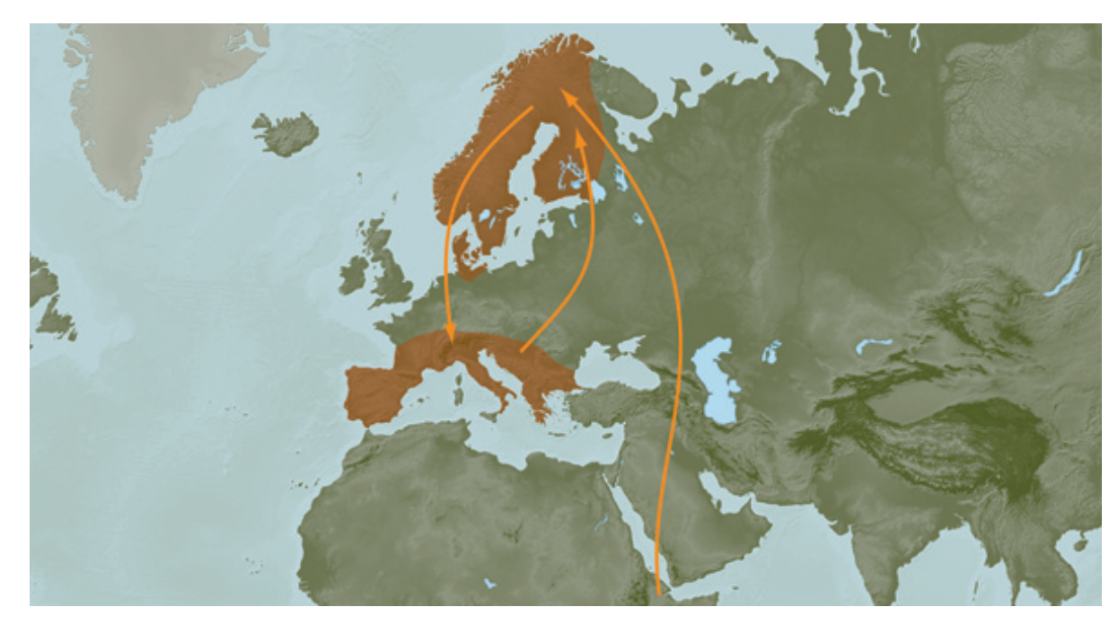
Your ancient ancestors traveled this path—settling for various periods of time at points along the way.

The Ice Age probably shaped the story of the Stonemasons. An ice shelf formed during the final stages of the Ice Age moved as far as southern Ireland, mid England and northern Germany, covering all of Scandinavia, where the Stonemasons lived. Northern Spain and continental Europe were covered in tundra during these climatic shifts. As the Stonemasons moved their homes south to hunt game below the tree line, they settled primarily in the Balkans, southern France, Iberia (present day Spain and Portugal) and