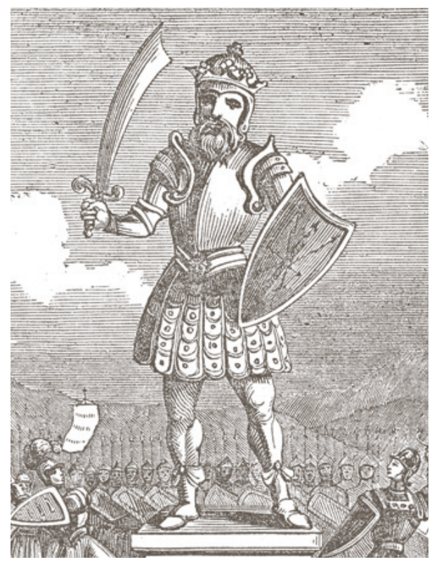
The god Woden (Odin) was a key figure in Scandinavian folklore.

Italy. As they migrated, The Stonemasons played a possible role in developing the distinct difference in the languages of eastern and western Europe. When the Ice Age ended, many of the Stonemasons returned to their northern homes and repopulated Scandinavia, Iceland and northwest Europe. Based on your DNA test, we're able to predict